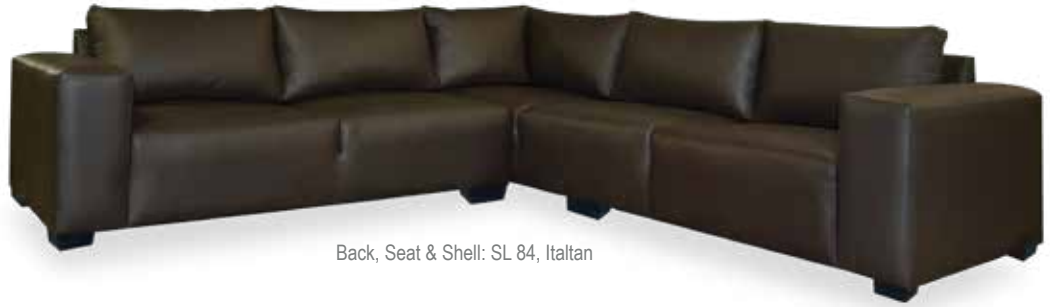
Back, Seat & Shell: SL 84, Italian